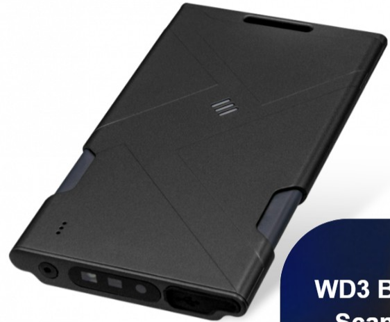
WD3 Badge Scanner Nwear